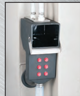
Safe chemical injection

Printed in the U.S.A. © Pellerin Milnor Corporation Brochure B22SLI4002/15063